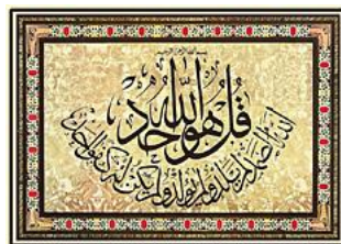
Beautiful Arabic calligraphy of Surah 112

No one shares His divinity, nor His attributes. In the Quran, God describes Himself. ‘He is God, the One... He begets not, nor was He begotten, and there is none like Him’.” Quran 112:1-4.